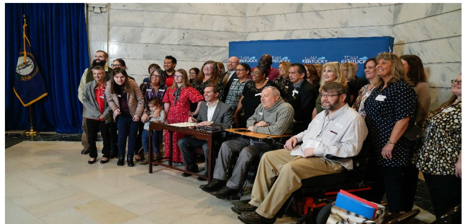
Governor Andy Beshear signs a proclamation for Developmental Disabilities Month on March 2, 2023.

What are Developmental Disabilities? Developmental disabilities include physical, learning, language, or behavior conditions diagnosed in childhood and expected to last throughout a person's life. Examples of developmental disabilities include attention deficit hyperactivity disorder (ADHD), autism spectrum disorder, cerebral palsy, hearing loss, intellectual disability, learning disability, or vision impairment.*