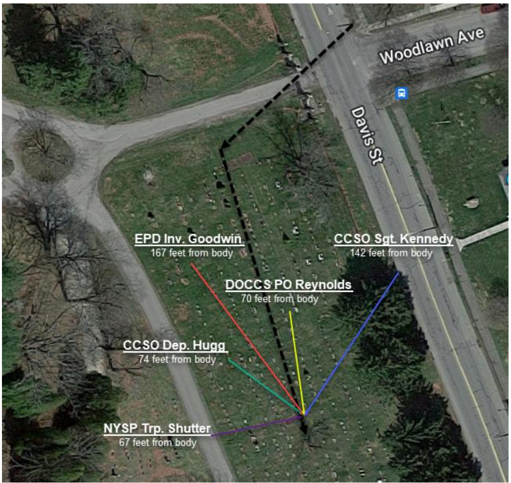
Mr. Wandell's approximate path in Woodlawn Cemetery is shown by the dotted black line. All distances shown in the photo are approximate.

except Trp. Shutter, who, through his attorney, refused OSI's interview request.<sup>6</sup> Interviews with the other shooting officers are summarized below. To contextualize their narratives, the below photograph shows the approximate location of the five shooters and their distance from Mr. Wandell.