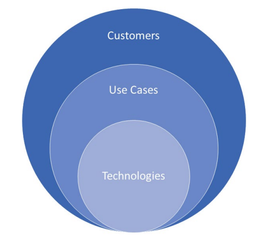
Figure 1 - IoT customers have use cases that technologies can fill

A key takeaway of Figure 1 is that technologies may be adopted for multiple use cases, which in turn may be relevant to multiple customers. When all use cases and customers can be anticipated and are expected, identifying all applicable risks and planning the best path to addressing those risks in the context of their customers' needs and goals will be challenging, but it is not common that all possible customers and use cases can be known. IoT products may be used by unexpected customers or for unexpected use cases even by expected customers in what can be called emergent use cases . For example, as consumers' homes accumulate more edge computing and network connectivity through further adoption of consumer IoT products, the home may become a nexus of consumers' digital lives. Healthcare, education and work are increasingly taking place remotely, allowing patients, caregivers, students, and teachers to interact and provide or access services using a foundational infrastructure in