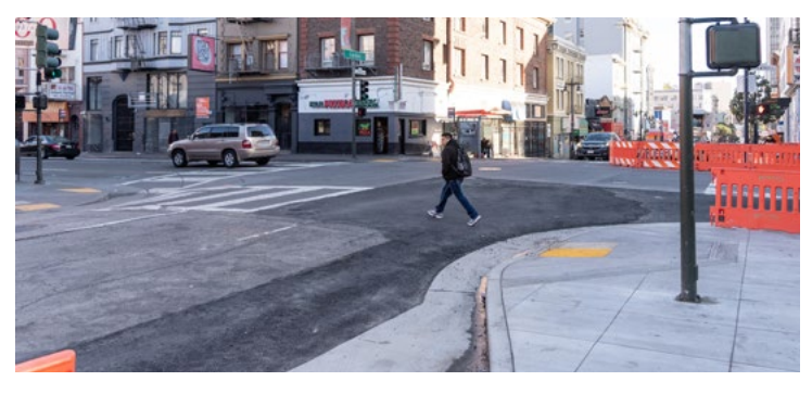
Crews recently installed the first of several pedestrian bulbs planned as part of the project at O'Farrell and Larkin streets.

By spring 2021, when these improvements are expected to be completed, Geary will be a safer, more enjoyable place for people to walk.