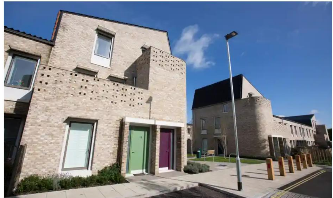
▲ Houses on Goldsmith Street.

For residents of eco-friendly Goldsmith Street, heating bills could be as little as £150 a year