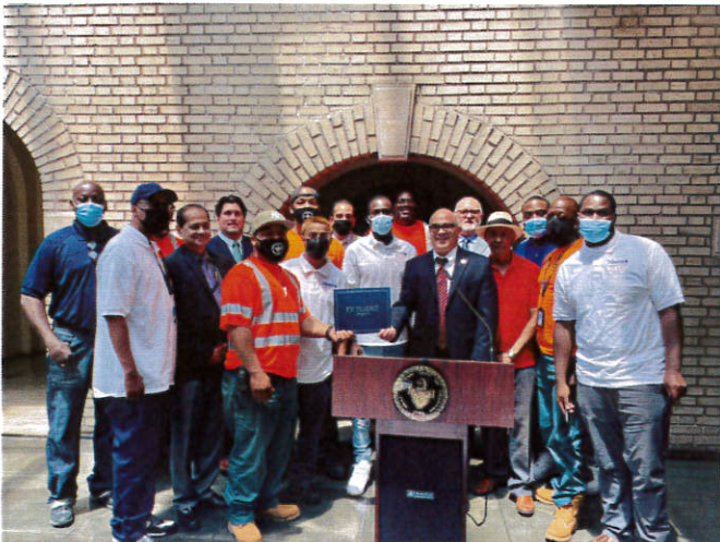
Mayor Gusciara with members of the TWW Training and Apprenticeship Program