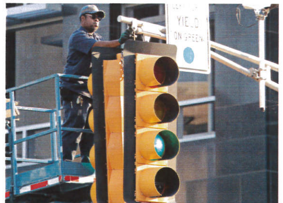
Maintenance of a City traffic light