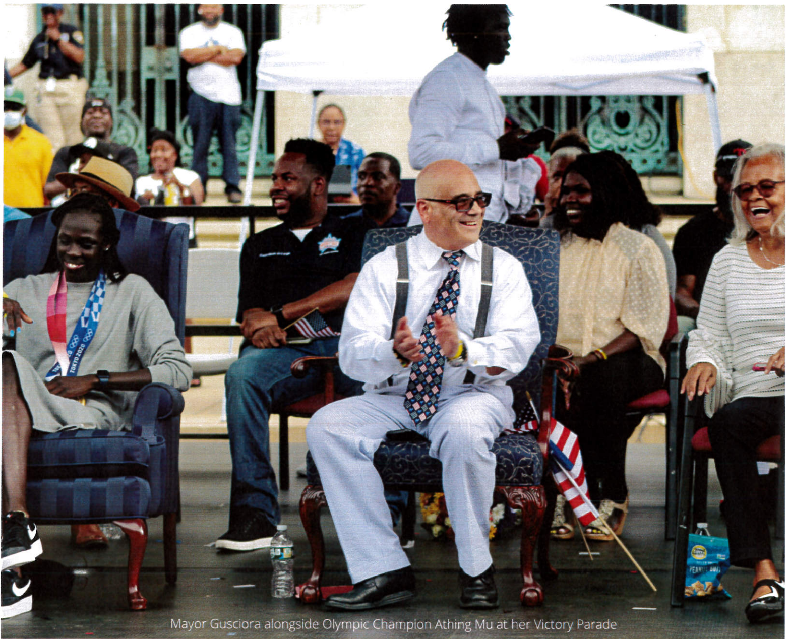
Mayor Gusciora alongside Olympic Champion Athing Mu at her Victory Parade