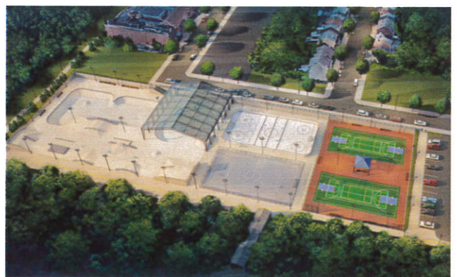
Rendering of the Amtico Square Sports Complex