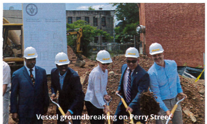
Vessel groundbreaking on Perry Street