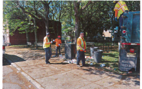
City employees beautify a City park