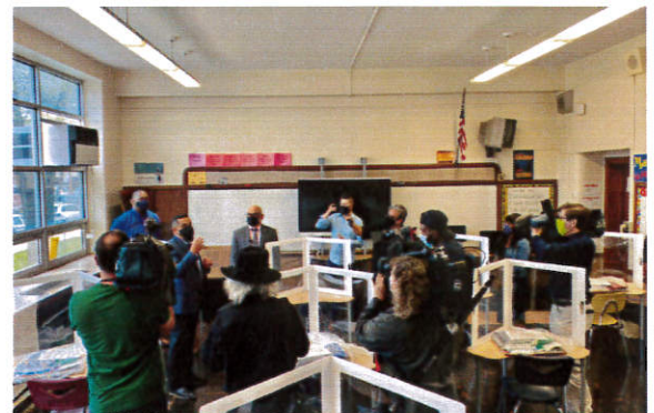
Mayor Gusciura touring TPS COVID-19 prep