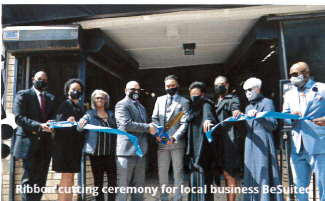
Ribbon cutting ceremony for local business BeSuted