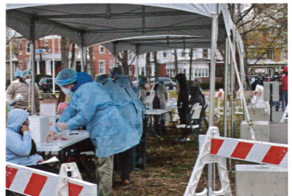
COVID-19 testing took place in parks across the City

Percent of population vaccinated in comparable towns and cities