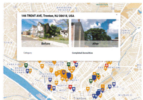
Track blight reduction at www.trentondemolition.com