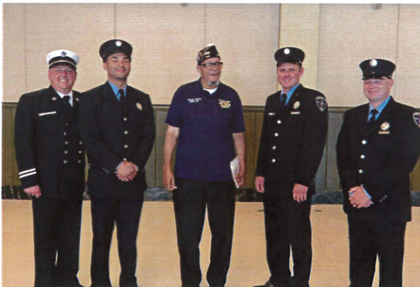
TFD firefighters receive the American Legion Firefighter of the Year Team Valor Award