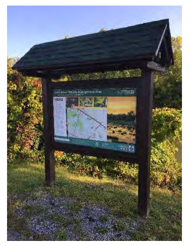
Kiosk at Utica Marsh WMA.

The 36-inch half-pipe riser water control structure is used to manipulate water levels through periodic drawdowns and allows for approximately 20 inches of water depth to be added or drained from the impoundment. Water depths within the wetland pool range from 0 - 4 feet deep and allow managers to control invasive species, promote desirable wetland plant species, or create mud flat habitat for migrating shorebirds. Water level manipulation does not occur annually, but typically water is drained from the marsh every 5-7 years depending on vegetative conditions. Under classic wet soil management, water is released for the growing season and then allowed to refill during late summer and early fall. The soils can oxygenate, and organic matter is broken down further to be utilized by regenerating emergent vegetation such as cattail, arrow-arum, and various sedge species, all of which are beneficial to wetland dependent wildlife.