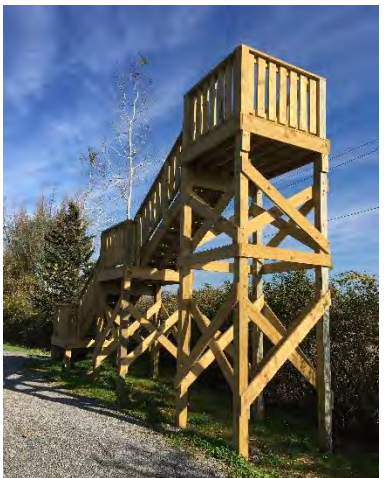
Observation tower overlooking the wetland pools on Utica Marsh WMA

In proximity to the wooden viewing tower, DEC has created a rounded gravel pad surrounded by large boulders to provide additional viewing opportunities. This area provides closer access to the West Pool and wildlife is easily seen from this location.