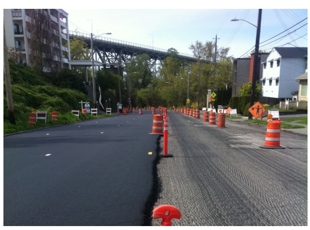
Example of paving work from Dexter Ave N paving project.