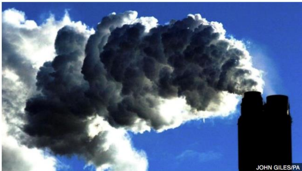
South Cambs has vowed to reduce carbon emission locally to zero by 2050

A local authority has pledged to beat government targets and reduce local carbon emissions to zero by 2050.