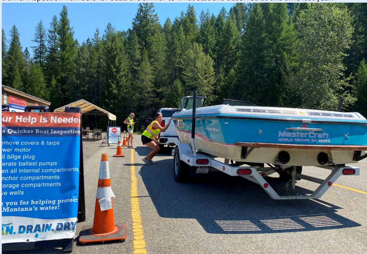
Watercraft Inspection Station - Troy

It's been hot and busy at watercraft inspection stations. Partner and FWP staff have conducted more than 52,000 inspections so far this season, with over 7,400 inspection over the 4 th of July weekend alone. FWP AIS and enforcement staff also conducted night operations at the Hardin inspection station June 31 through July 3 rd to obtain information on boat movement at night. Few boats were observed and most of them were local traffic. Inspection numbers for 2021 are similar to what stations observed at this time last year.