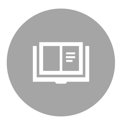
ON THE SIRF