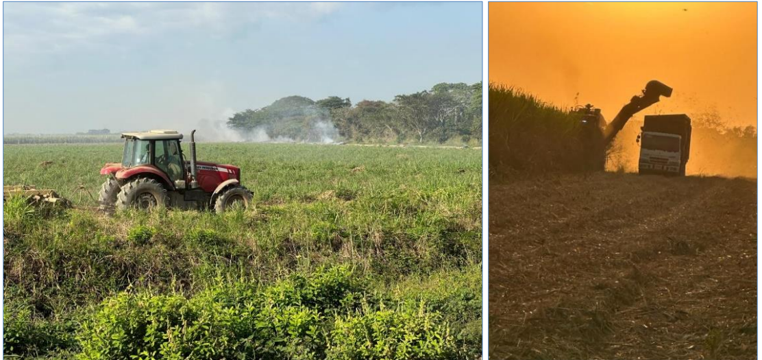
Figure 1. Sugarcane Fields in Papelon, Portuguesa

Venezuela typically produces two sugarcane crops, with the first cycle occurring from October through April, and the second from June to October. Portuguesa is the largest sugarcane growing state, representing 85 percent of total production, followed by Aragua and Lara states (Figure 1).