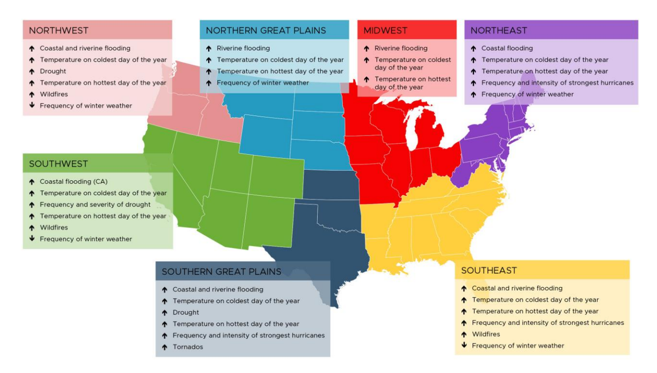
Figure 3. Map of the contiguous United States with projected regional climate change hazards, based on analysis in the NCA 2018. The NCA also provides projected climate change hazards for Alaska and Arctic and Hawaii and the Pacific Islands.