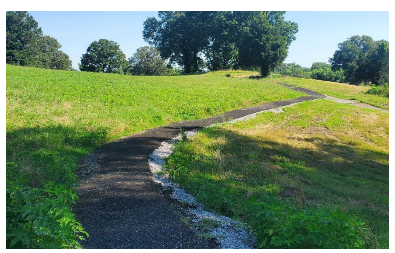
Figure 5: Greenway Trail.

The process of implementation was divided into two parts. The first included the collection, recycling, and disposal of illegally dumped scrap tires that plagued the communities surrounding T.O. Fuller State Park. This was followed by the reconstruction of the hard surface path. The project allowed the community to repurpose 24,000 indiscriminately discarded waste tires, divert them from landfills, and create a new greenway trail that provides a safe recreation space for users to enjoy. The new trail system is equal parts accessible—incorporating Americans with Disabilities Act compliance where it previously was absent—and inspiring, demonstrating how important inviting recreational facilities are to any community.