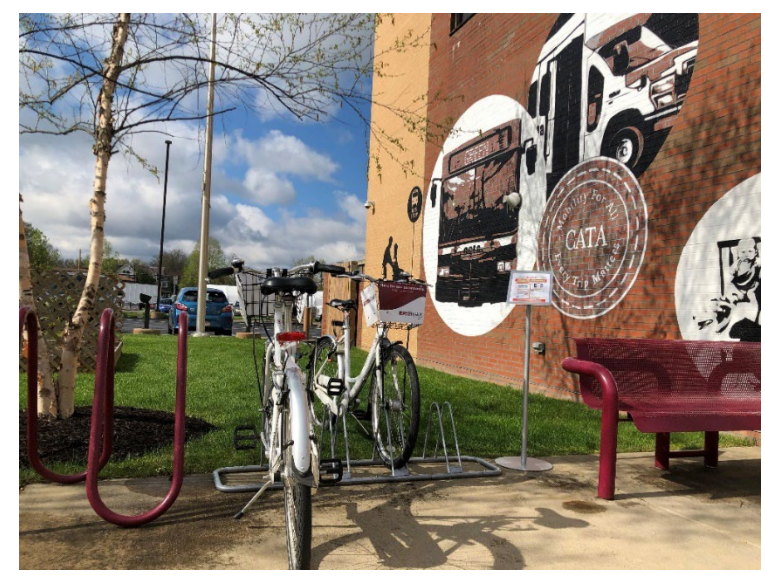
Figure 3: Bikeshare station at the CATA transfer point in Meadville, PA.

The Meadville Bikeshare launched in the spring of 2021, completing over 650 rental transactions in its first year. The Bikeshare operates seasonally from May to November as a smartphone based, dockless program that does not require parking stations and allows users to rent and return bicycles to predesignated locations through rear-tire locking using Bluetooth technology. The Bikeshare program initially offered rental locations at recreational areas, various downtown locations, and public transportation transfer points. With the success of the first year, NPMA was able to secure additional local funding to acquire new 3-speed belt drive bicycle and began to expand the program to more locations such as Allegheny College and the Arc of Crawford County community space on Market Street.