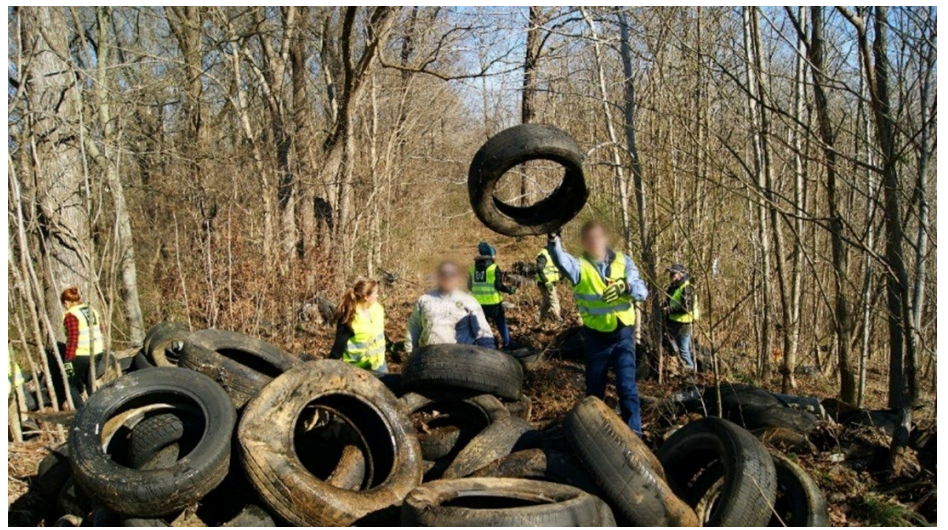
Figure 6: Volunteers removing dumped tires to use for the Tires to Trails project.

physical and mental health. No one single government agency, non-profit, or otherwise could have completed this project independently. Though it took years of planning and group cooperation, this Tires to Trails project proudly showcases what can be achieved with determination, ingenuity, and collaboration.