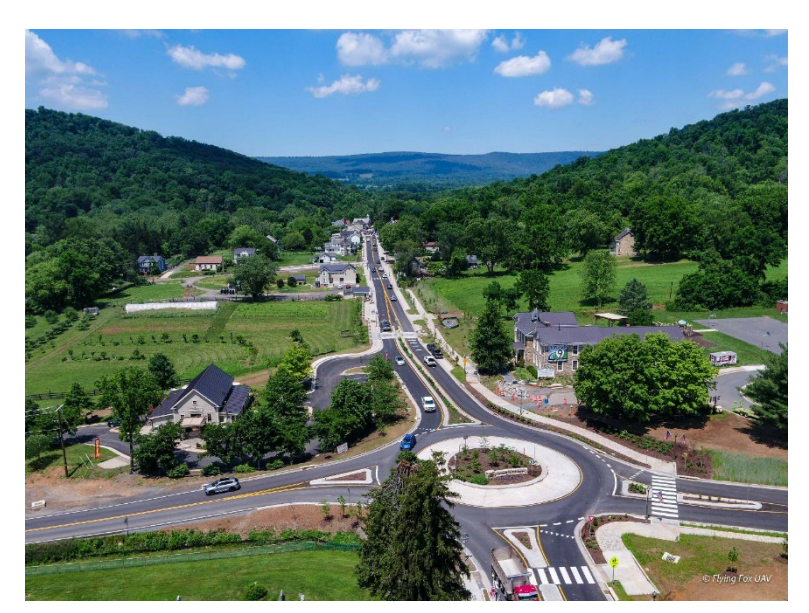
Figure 1: In rural Loudoun County, NVTA funded the Route 9 traffic calming project through the town of Hillsboro, featuring enhanced sidewalks, crosswalks, and roundabouts.

To date, NVTA has allocated more than 40 percent of its $3.1 billion revenues to non-roadway projects, although even highway projects will typically include enhanced quality of life and active transportation components. One such example is the Route 9 traffic calming project through the town of Hillsboro