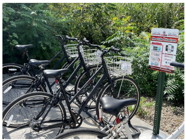
Figure 4: Bikeshare station at Ernst Trail.

After a successful program in the first few years, the NPMA received an Act 13 Environmental Planning grant from Crawford County to expand the Bikeshare to the city of Titusville in the future. This grant aligns with the FHWA Neighborhood Access and Equity Program and Low-Carbon Transportation Materials Grant programs which aim to improve community connections, reduce environmental impacts, and increase walkability, safety, and affordable transportation access.