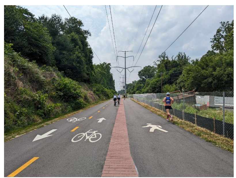
Figure 2: On behalf of the Northern Virginia Regional Park Authority, NVTA funded a project through the city of Falls Church to create a "dual" on a busy segment of the Washington and Old Dominion regional trail, providing separate lanes for pedestrians and bicyclists.

for pedestrians and bicyclists (see Figure 2). These examples follow <a href="FHWA Bicycle and Pedestrian">FHWA Bicycle and Pedestrian</a> <a href="Planning">Planning</a>, <a href="Program">Program</a>, <a href="mailto:and-Project Development">and Project Development</a> <a href="guidelines">guidelines</a> for improving safety and increasing active transportation.