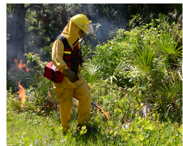
Prescribed fire is a cost-effective tool to manage habitats for a variety of wildlife.

In 2022-23, available funds through this cooperative program totaled over $420,000, which will support 29 projects on 21 managed properties in Florida, including wildlife management areas and national wildlife refuges. These habitat improvement projects include prescribed fire, roller chopping, applying herbicides, mulching and wildlife plantings.