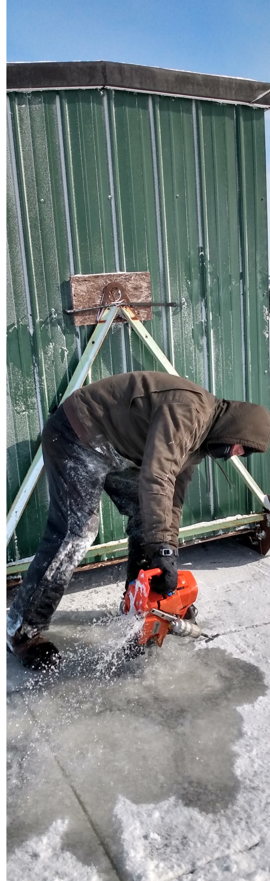
Cutting in on Lake Winnebago.

It is unlawful for any person to transport an unregistered sturgeon in or on any motor driven vehicle unless the sturgeon is openly exposed. "Openly exposed" means open to view by a person in a passing vehicle.