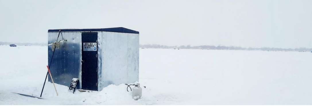
Ice shanty on Lake Winnebago.