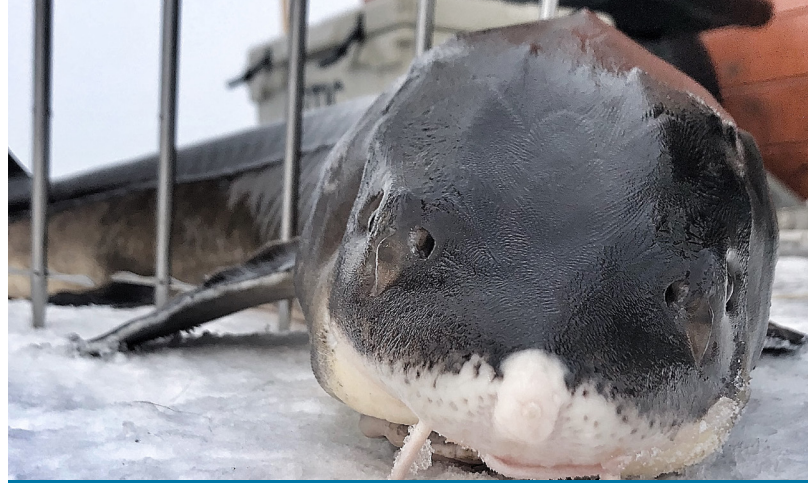
Hunter Zakrzewski's sturgeon harvested from Lake Winnebago.