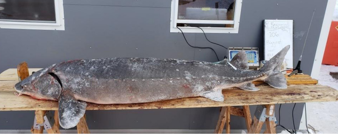
Steven Lenz's 78.2 inch, 154.5 lb sturgeon harvested in 2021 from Lake Poygan.